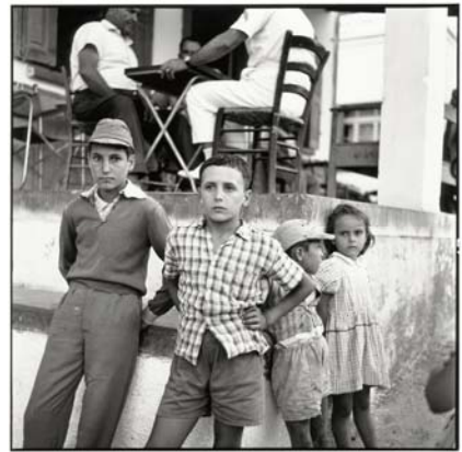
Astypalaia 1963. At the port.

4, rue sainte-anastase 75003 paris - france - tél. 01 42 78 08 07 - sit.down@wanadoo.fr - www.sitdown.fr