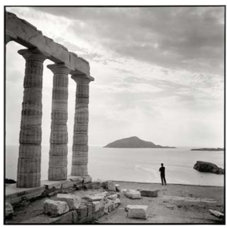
Sounion 1955. The temple of Poseidon