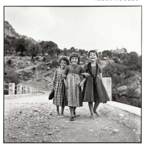
Epeiros 1961. The three companions.