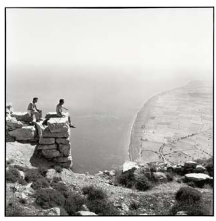
Thera 1961. View of Perissa from Ancient Thera