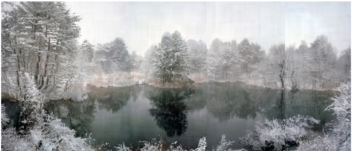
The White Contamination series, 0,357 Bq, 2017 Pigment Print on Japanese Mulberry paper Size: 29 1/8'' x 62''

For its second participation to the Photography Show by AIPAD, galerie SIT DOWN is pleased to be part of Project Spaces , a new section dedicated to curated spaces around a single artist or specific theme.