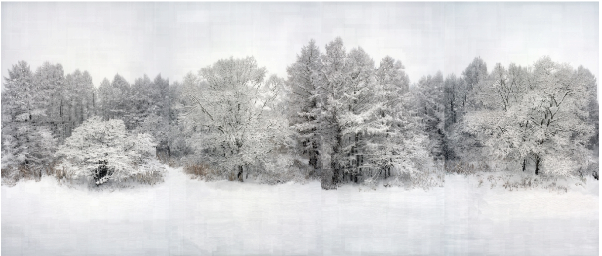
The White Contamination series, 0,412 Bq Pigment Print on Japanese Mulberry paper Size: 15 3 / 4 x 31 1 / 2 inch ©Florian Ruiz courtesy galerie Sit Down