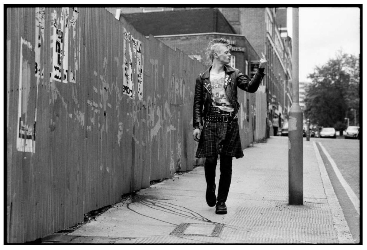
Anarchy in the UK series

In connection with the publication of Yan Morvan's new photobook, Years of Iron, London 1979-1981 (Serious Publishing), Sit Down Gallery presents Anarchy in the United Kingdom, an exhibition of a selection of prints whose negatives have been forgotten in a box named "England" since the eighties.