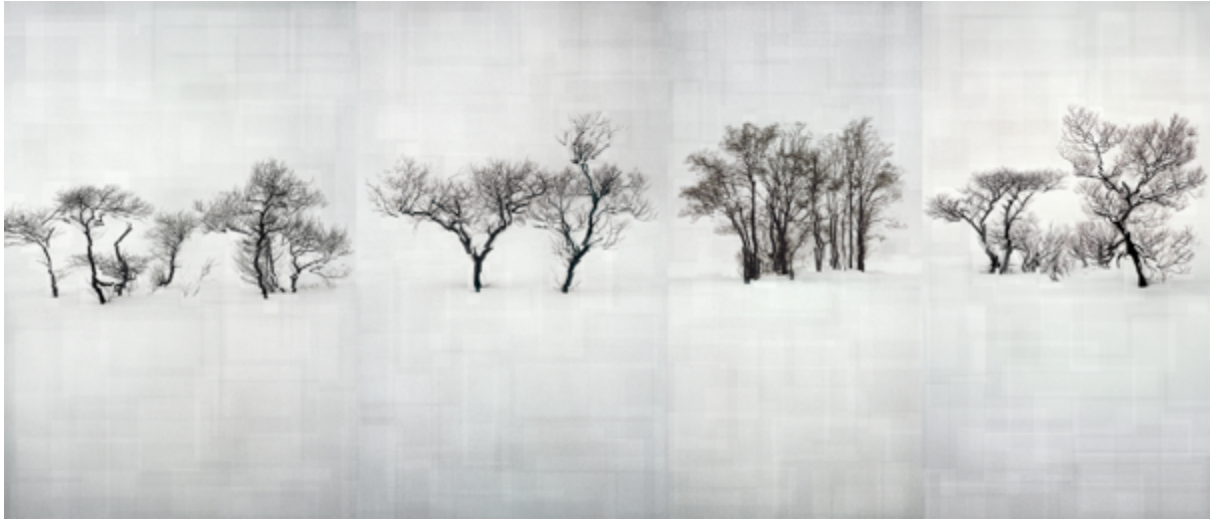
The White Contamination series, 0,363 Bq, 2014 Pigment print on Japanese Mulberry Paper ©Florian Ruiz courtesy galerie Sit Down