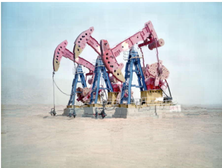
Project 596 series, 0,531 Bq, 2014-2019 Pigment print