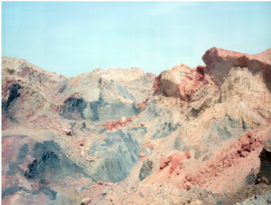
Project 596 series, 0,734 Bq, 2014-2019 Pigment print