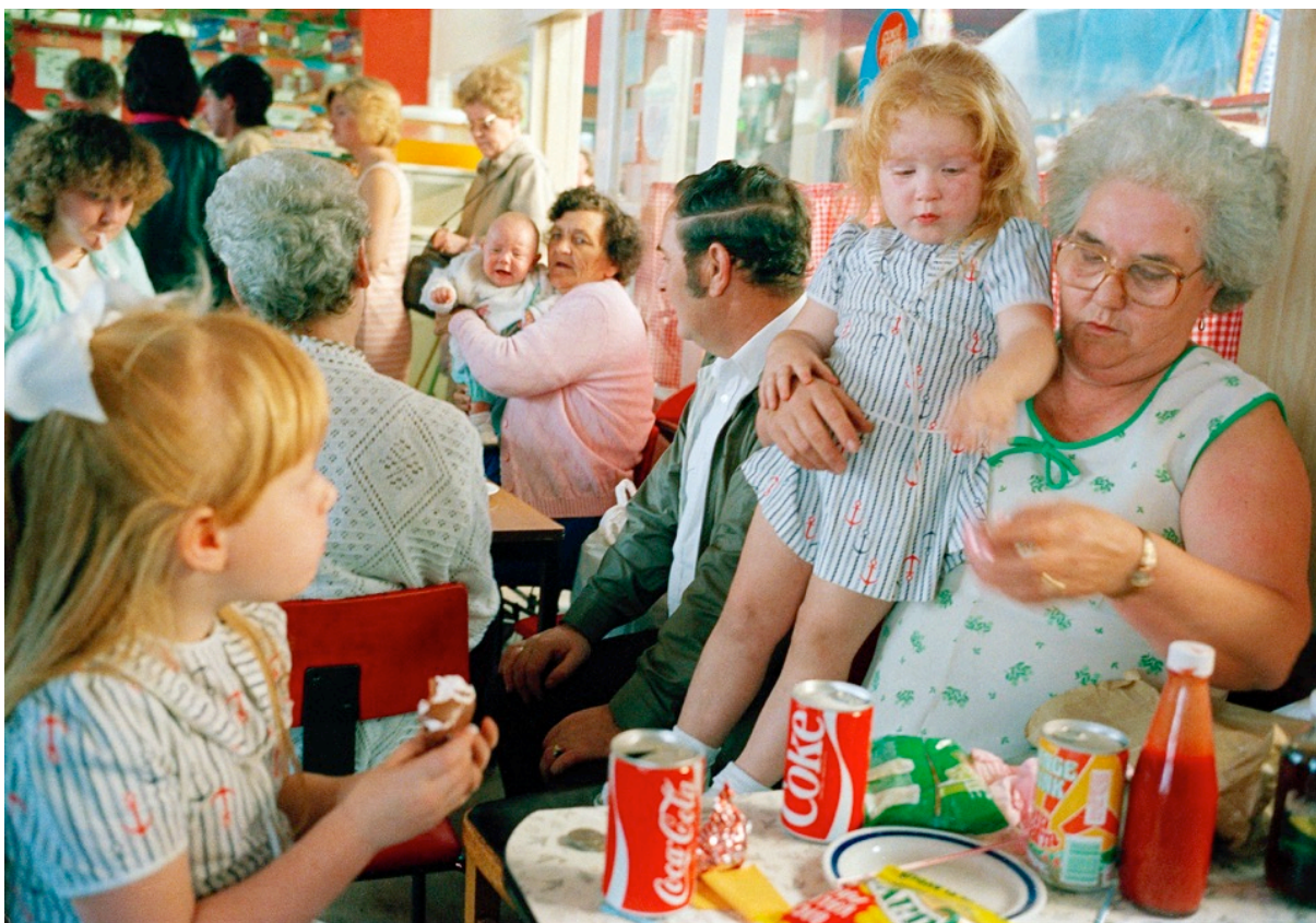
Tom Wood, Old time parting , 1983, Pigment print

The Sit Down gallery is pleased to announce its new exhibition dedicated to Tom Wood : Snatch out of time , on the occasion of the release of his new eponymous book by SUPER LABO Editions, Tokyo.