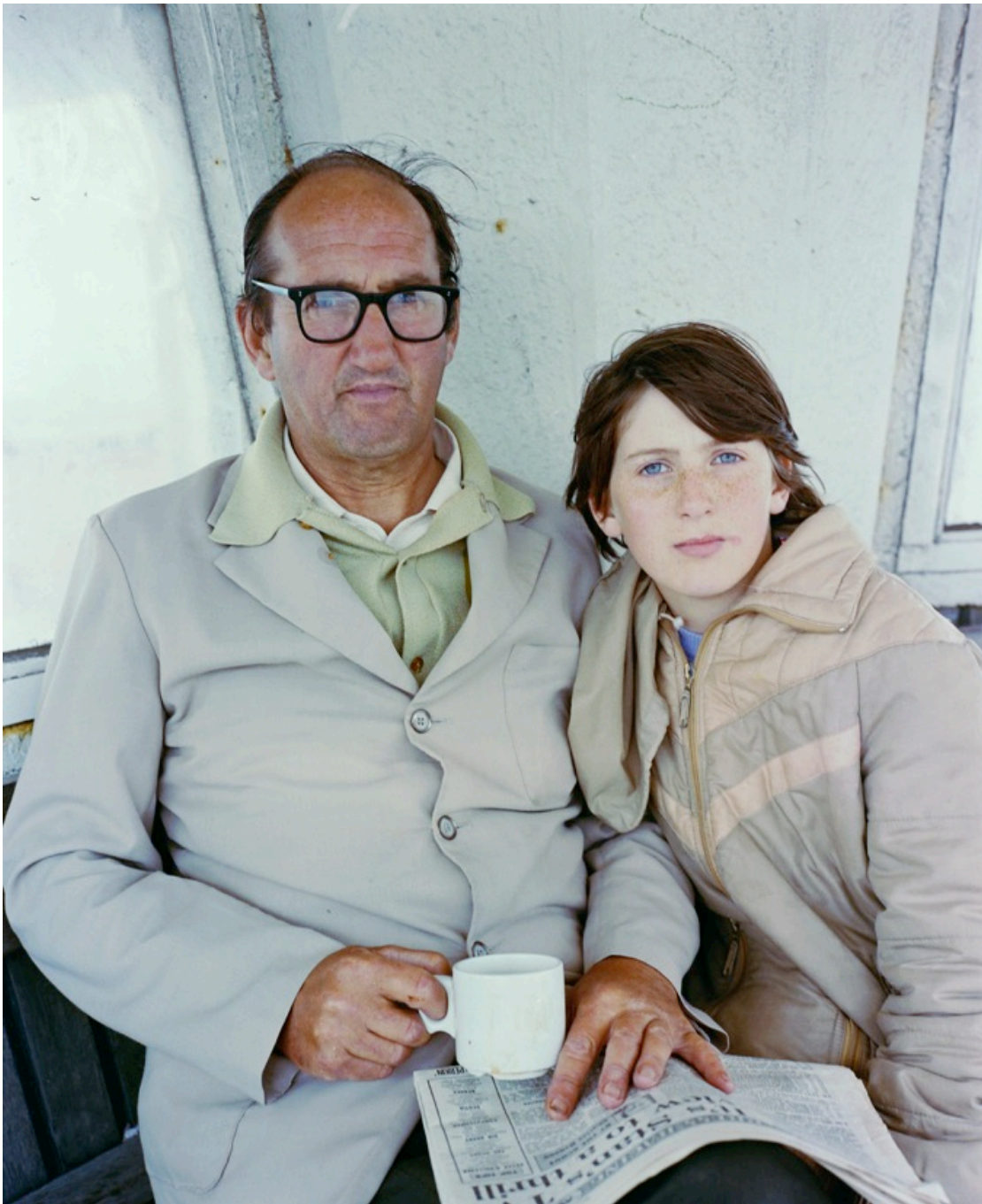
Tom Wood, Prom shelter picnic , 1983, Analogue C-Type Handprint © Tom Wood courtesy galerie Sit Down