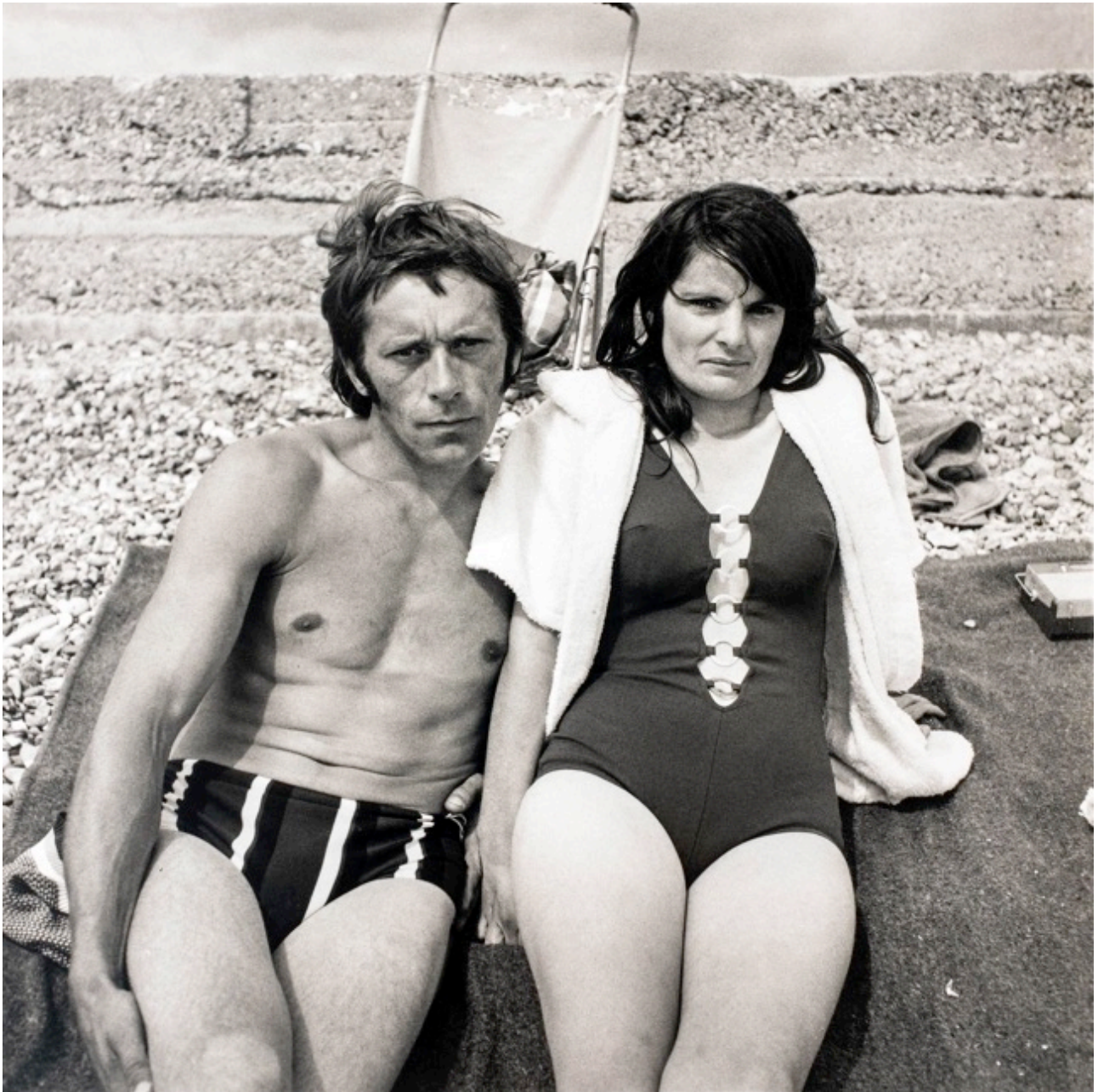
Tom Wood, On the beach, South coast of England , 1973 Gelatin silver selenium-toned analogue darkroom print