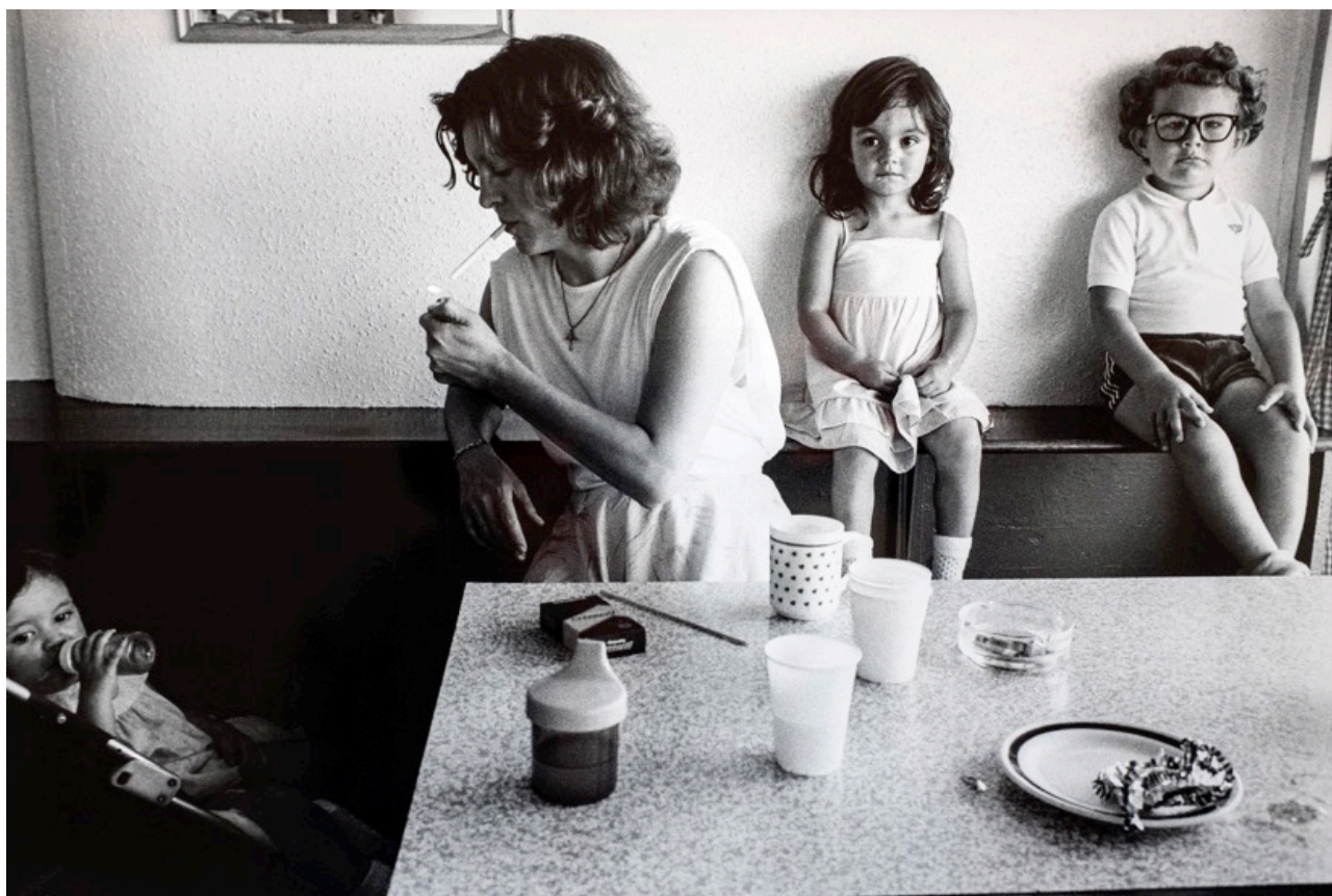
Tom Wood, Being good , 1982, Vintage gelatin silver print, made by the artist © Tom Wood courtesy galerie Sit Down