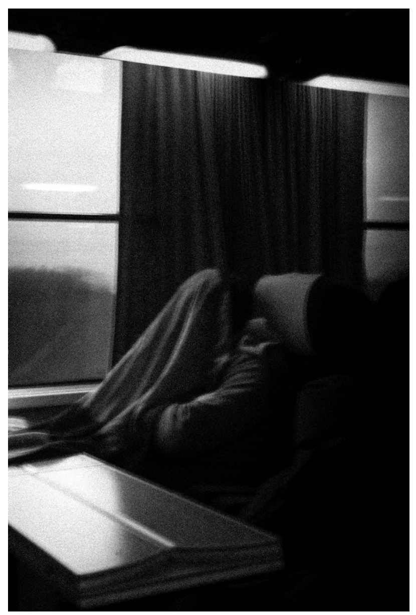
Antoine Lecharny, Untitled #08, 2021 Series : Côté Fenêtre Pigment print on Fine Art paper © Antoine Lecharny courtesy galerie Sit Down