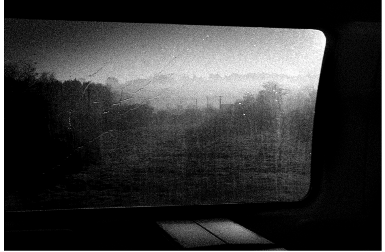
Untitled #20, 2021. Pigment print on Fine Art Paper.

The Sit Down gallery is pleased to present Côté Fenêtre , the first solo exhibition of Antoine Lecharny, photographer and visual artist born in 1995.