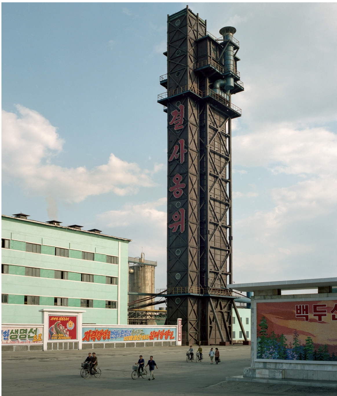
Series Unperson . Hamhung Chemical Factory, 2019