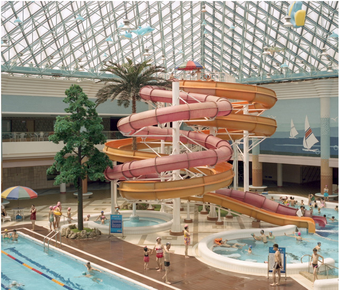
Series Unperson . Munsu Water Park in Pyongyang, 2019