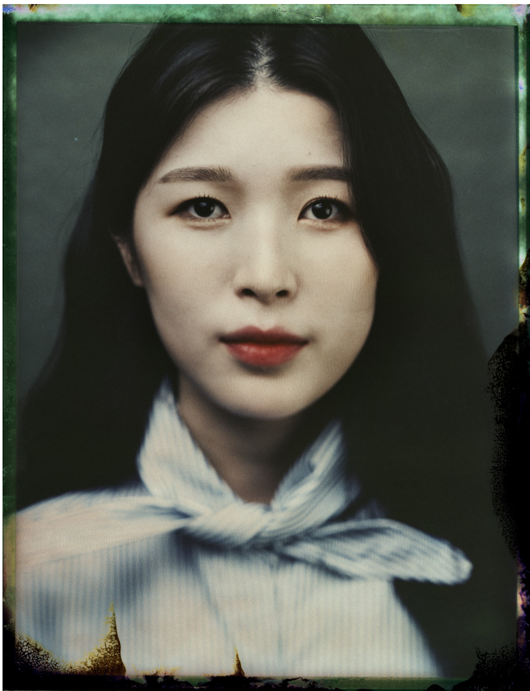
Series Unperson . Kang Nara, 2019 Pigment print on Fine Art paper