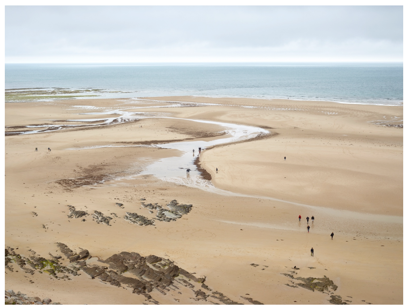
Cape Carteret, Cotentin, 2021, series Impressions of Normandy