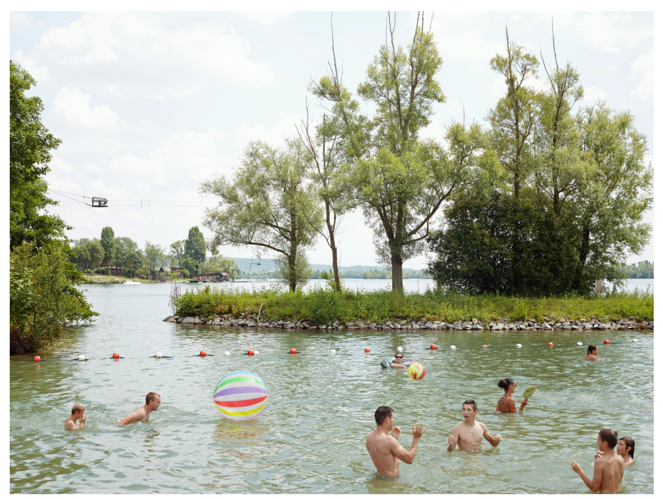
Léry Poses leisure park, Eure, 2014, series Impressions of Normandy