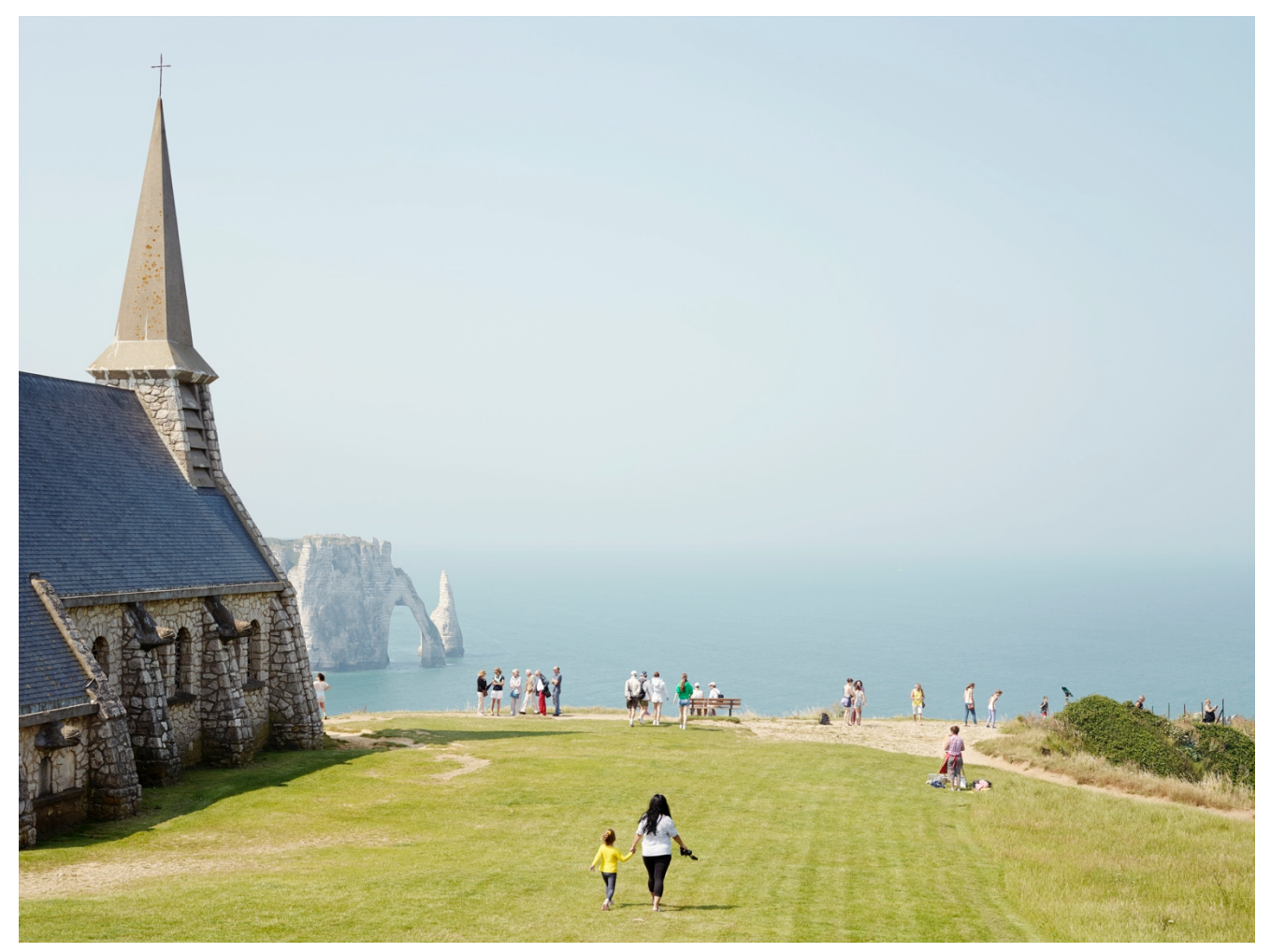
Chapel of Our Lady of the Guard, Etretat, 2014, series Impressions of Normandy