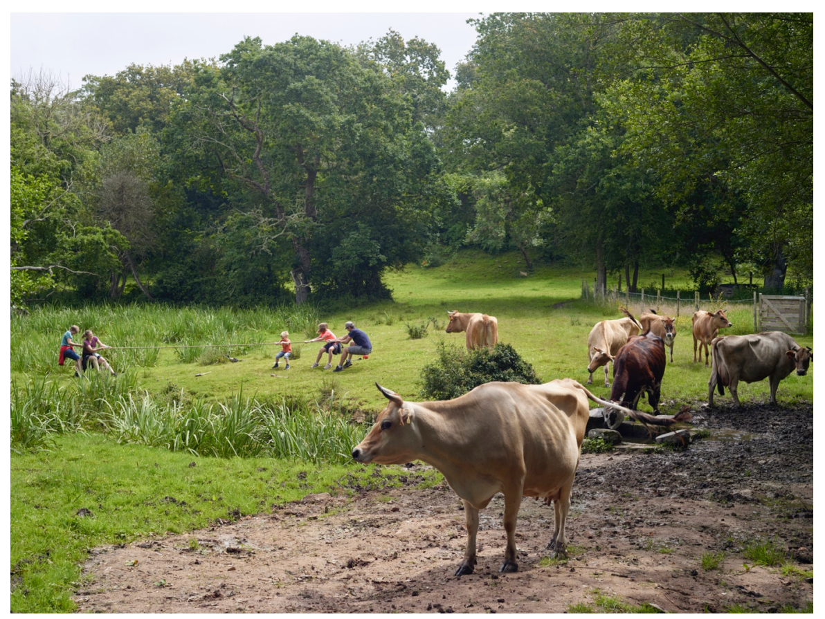
Golf paysan, Flamanville, Cotentin 2021, series Impressions of Normandy

*This series was made during a residency initiated by Centre photographique Rouen Normandie from 2014 to 2016, which led to two exhibits in Rouen (2017) and in Caen (2018). The residency continued in 2021 in Cotentin, Normandy, resulting in a show at Château de Flamanville.