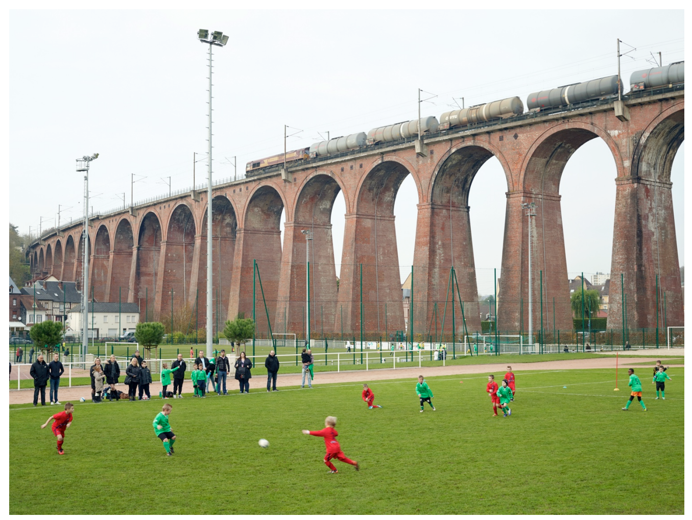
Barentinois Football Club, Barentin, 2014, series Impressions of Normandy