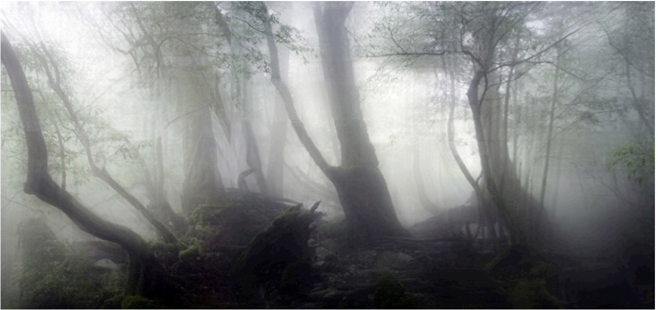
Series Seiki , Seiki #12, 2021 © Florian RUIZ courtesy galerie Sit Down