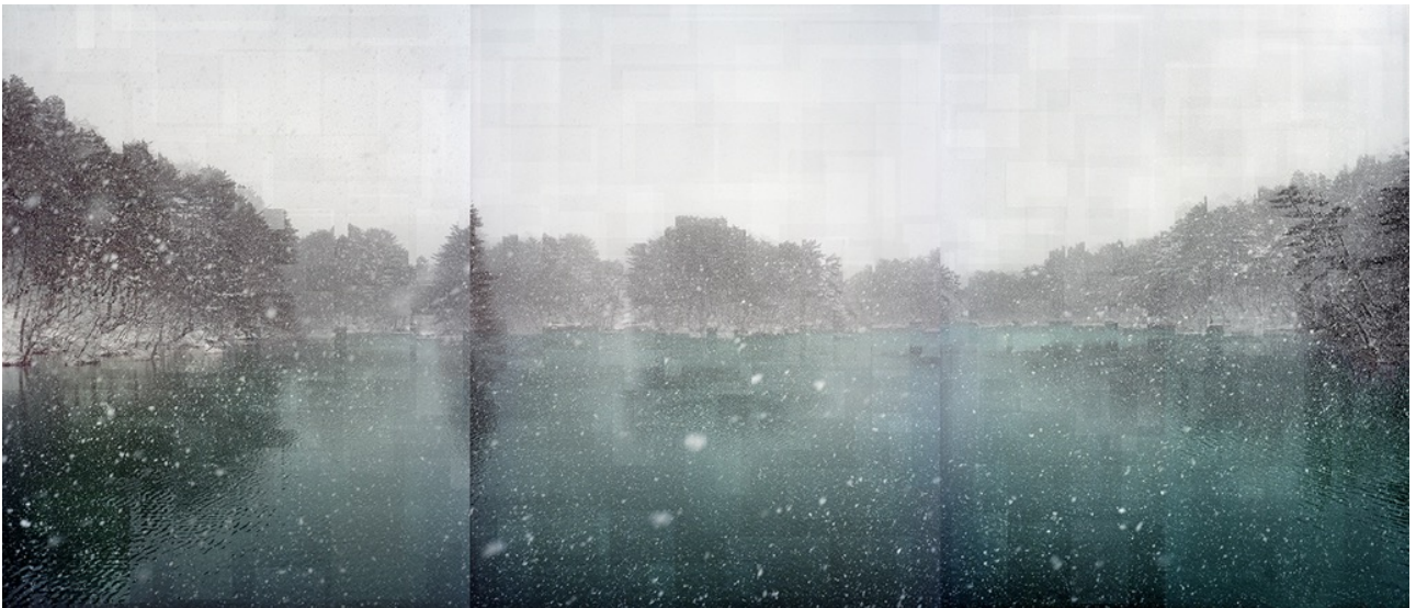
Series The White Contamination, 0,453 Bq, 2013 © Florian RUIZ courtesy galerie Sit Down