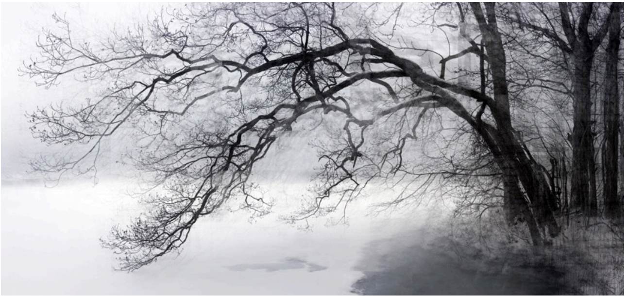
Series Seiiki, Seiiki #21, 2021