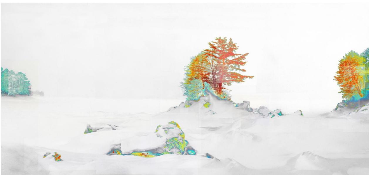
Series Onikuma, Onikuma #1, 2024

Opening with the artist on Friday, May 3, 2024, from 6:00 pm to 9:00 pm